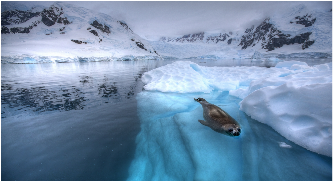
First (above): Johan Beyers of Tygerberg with Weddel Seal (awarded 79 out of 90)