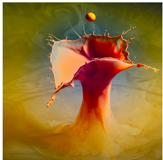
Third: Arthur Fitt of Cape Town with Anticipation (78 out of 90)