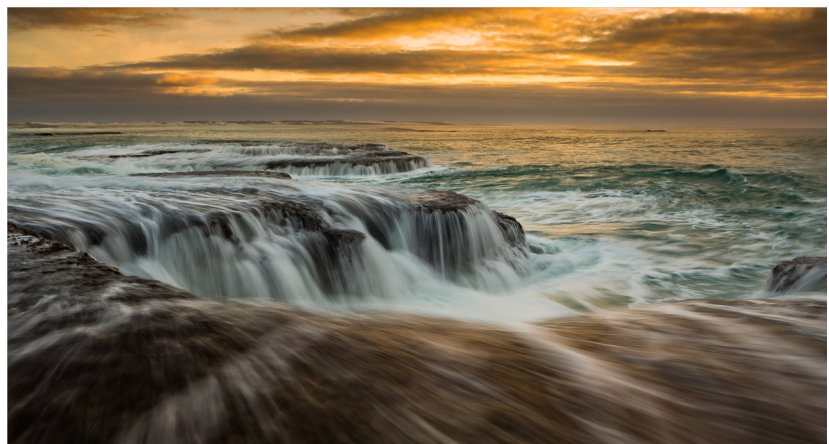
Second: Juan Venter of Tafelberg with Water Move (78 out of 90)