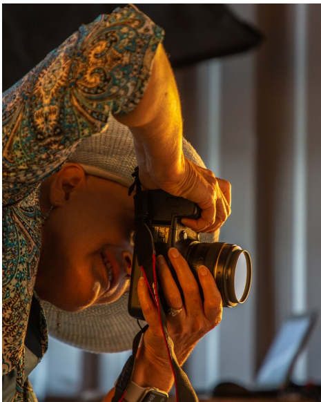
A photographer (Carina de Klerk) in the studio behind the camera.

For some of our members it was a first experience of formal portrait photography in a studio with proper lighting. And for some it was a first opportunity to act as a model in such a set-up.