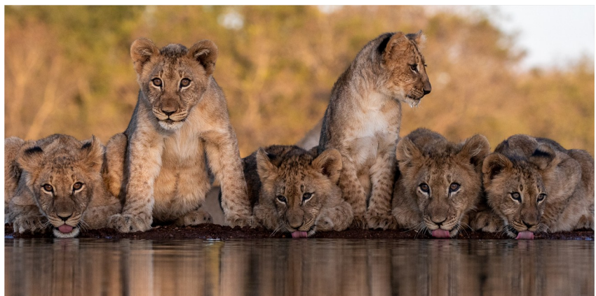
Silver medal for "Huddled Together" by Charles Naudé.